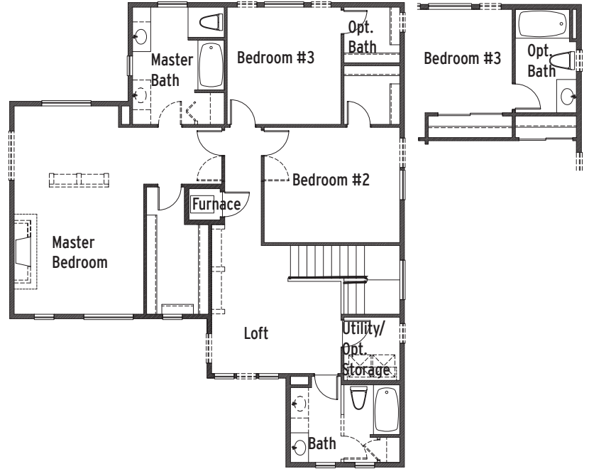
2240 Series Upper Floor

Approx. 2,281 square feet 3 - 4 Bedrooms 2.5 - 3.5 Baths Two-car Garage