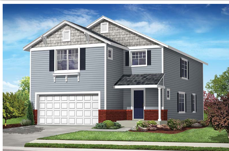
Artist's rendering does not reflect color or exterior choices and is used for demonstration only.

8419 79th Street NE | Marysville, WA 98270